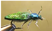
Green Back Beetle # 10 €1,52, £1.00, US$2.00, 14 SEK