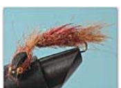
NGD M Dragon #12 streamer attached, rust or olive. €1.70, £1.35, US$2.70, 16 SEK