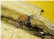
"Flying" Spider # 12-14 € 1.30, £0.85, US$1.75, 12 SEK