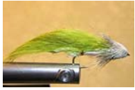
Zuddler # 6-12, olive, black, brown. €1,60, £1.25, US$2.50, 15 SEK