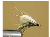
LE CdC Emerging Caddis Hanging in the surface. # 14 -18 (klinkhamer extreme), green, tan, tan, brown, orange. €1,52, £1.00, US$2.00, 14 SEK