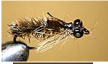
Dragon Fly Nymph #8-10 Long Shank Sedge Hook. €1,52, £1.00, US$2.00, 14 SEK