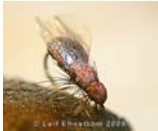
Red Flying Ant - #12-16, foam body. €1,52, £1.00, US$2.00, 14 SEK