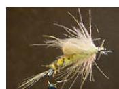
LE Hatching Ephemera # 6-8 TMC 200R. €1.70, £1.35, US$2.70, 16 SEK