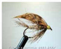
March Brown Wet Fly