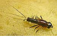
Nymph Head Heptagenia Nymph. # 12 long nymph. €1.70, £1.35, US$2.70, 16 SEK