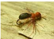
LE Foam Ant - # 12-16, red or black. € 1.30, £0.85, US$1.75, 12 SEK