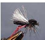
"Ryssflugan" Bibio Pomonae - # 10-12 slightly extended. €1,52, £1.00, US$2.00, 14 SEK