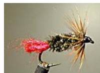
Red Tag Wet Fly