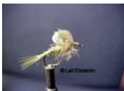
LE Hatching May # 10-14, Blue Dun, Brown, Olive €1,52, £1.00, US$2.00, 14 SEK