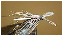
Mosquito - # 14-16 €1,52, £1.00, US$2.00, 14 SEK