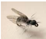
Black Flying Ant - # 12-16 €1,52, £1.00, US$2.00, 14 SEK