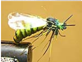
LE Extreme Wasp # hook 14 Klinkhamer Extreme LE Extreme Wasp