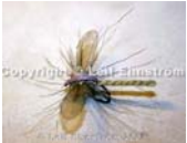
LE Daddy Long Legs - hook 12 extended body. €1,52, £1.00, US$2.00, 14 SEK