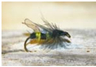
CdC Wasp - #10-12 €1,52, £1.00, US$2.00, 14 SEK