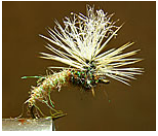
Spectra Klinkhamer # 14-16, beige, brown, olive, black €1,52, £1.00, US$2.00, 14 SEK