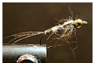
NH Softbody Nymph #12-16, tan, brown, black, olive €1.70, £1.35, US$2.70, 16 SEK