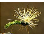
Paraloop Klinkhamer #12-16 Klinkhamer hook. Beige, olive, black, brown. €1,52, £1.00, US$2.00, 14 SEK