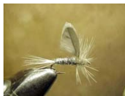
Blue Dun Burnt Wings

Light Cahill March Brown* Quill Gordon Red Quill Royal Coachman