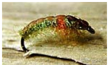
LE Czech Nymph # 10-12 Partridge Czech nymph hook. Olive, beige, brown or black with dots in orange, red or pink. Back brownish. €1,52, £1.00, US$2.00, 14 SEK