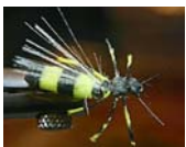
LE Foam Wasp # 10 extended. €1,52, £1.00, US$2.00, 14 SEK