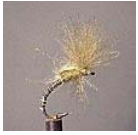
CdC Midge Emerger # 14-16 €1,52, £1.00, US$2.00, 14 SEK