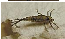
LE T-Nymph # 12-16 TMC 200R. Brown, olive, black, tan €1,52, £1.00, US$2.00, 14 SEK