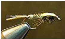
LE Softbody Nymph #12-16, tan, brown, black, olive € 1.30, £0.85, US$1.75, 12 SEK